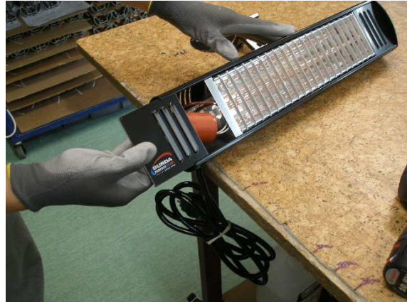
4. Dismount a front cover with a logo