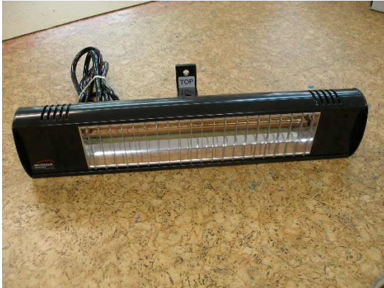
1. Heater ready for replacing an emitter