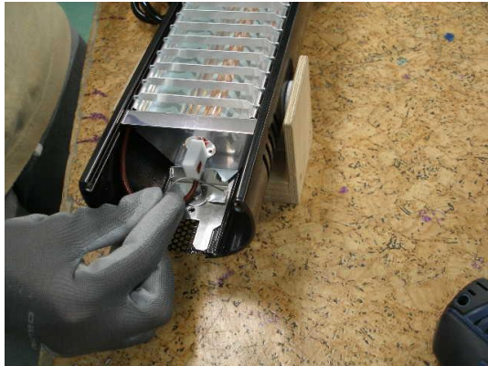
8. Dismount a spring holding the emitters