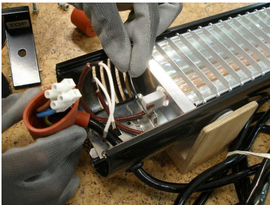
9. Dismount a spring at the second side