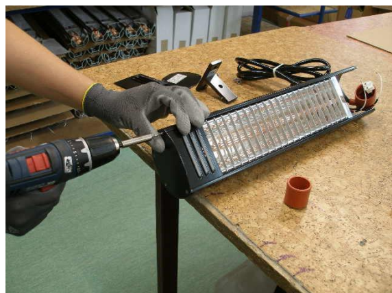
6. Disconnect a second side cover