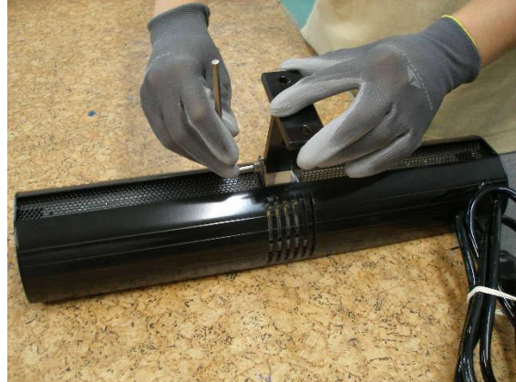
2. Unscrew and dismount a bracket hinge