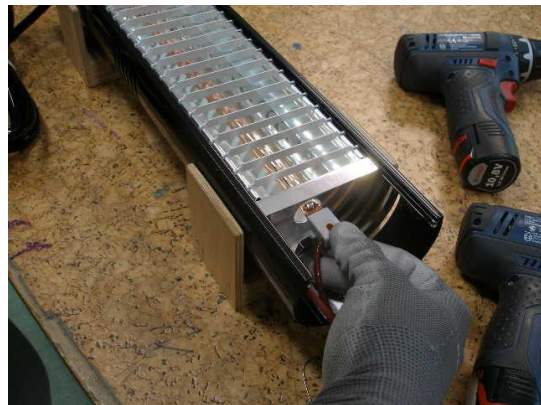
10. Turn a cap of the emitter