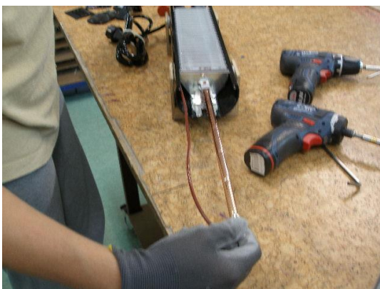
11. Take out the faulty emitter from the housing and replace it with a new one.

After replacing refit the new emitter in reverse order