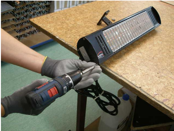
3. Dismount a side cover