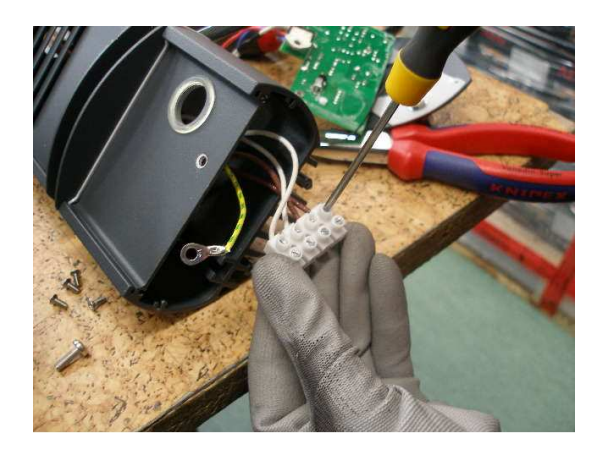
12. Replace the luster terminal

PLEASE REASSEMBLE THE NEW BT CIRCUIT BOARD IN REVERSE ORDER.