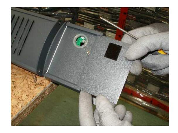
5. Carefully remove the plate with glass