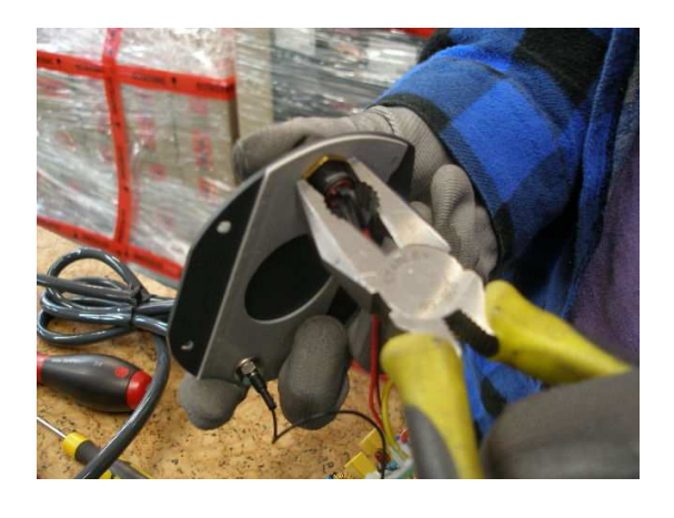
8. Unscrew the breaker nut