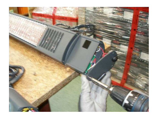
2. Carefully open the page element