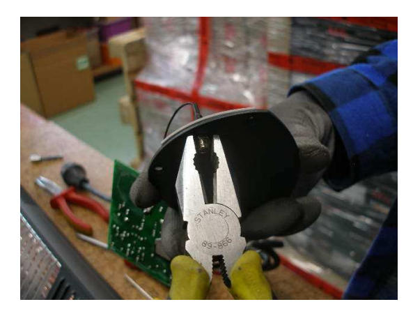
11. Unscrew the antenna nut