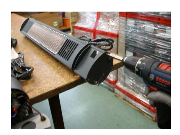
1. Remove the 4 screws in the side element