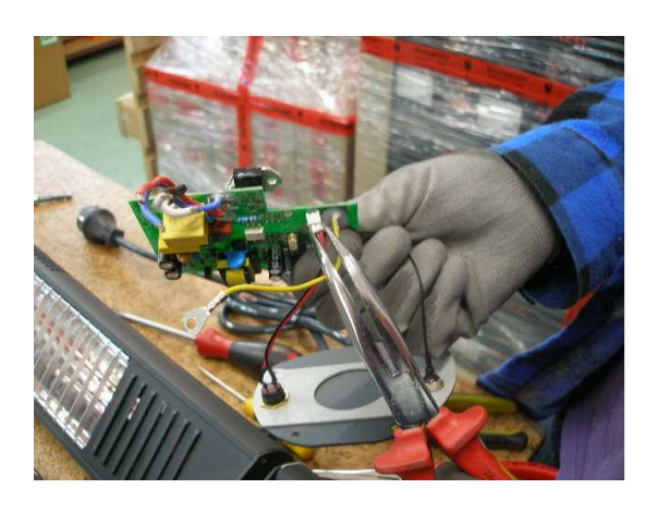
9. Disconnect the antenna connector of the BT printed circuit board