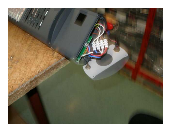
3. Remove the luster terminal