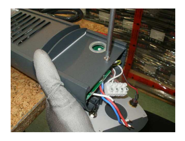
6. Remove the Triac (Symistor) screw