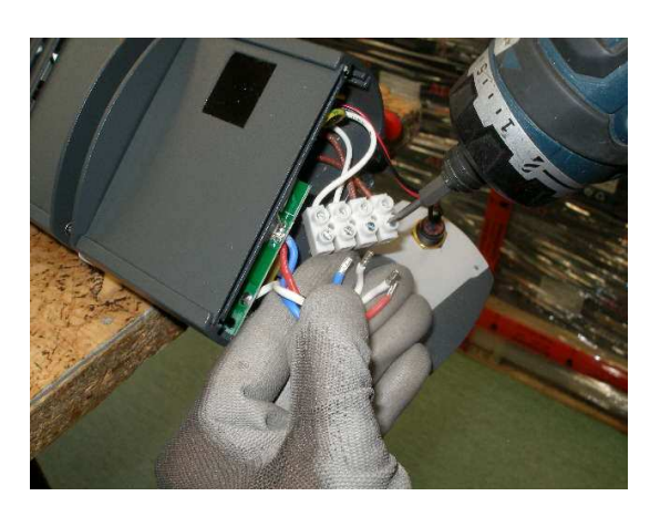
4. Unscrew the wires of the BT-board